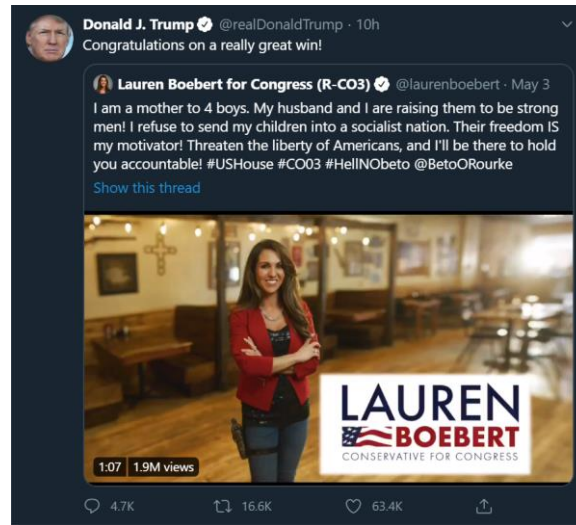
[Donald J. Trump, Twitter, 7/1/20 ]