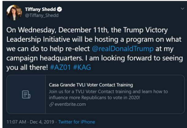
[Tiffany Shedd, Twitter, 12/4/19 ]