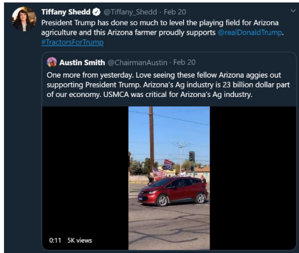
[Tiffany Shedd, Twitter, 2/20/20 ]