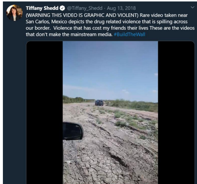
[Tiffany Shedd, Twitter, 8/13/18 ]