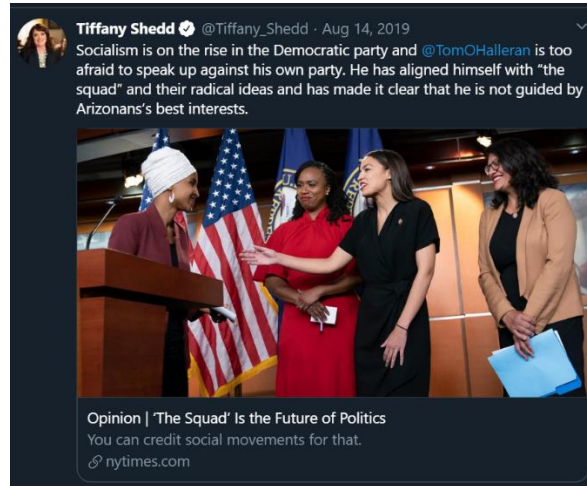
[Tiffany Shedd, Twitter, 8/14/19 ]