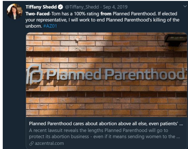
[Tiffany Shedd, Twitter, 9/4/19 ]