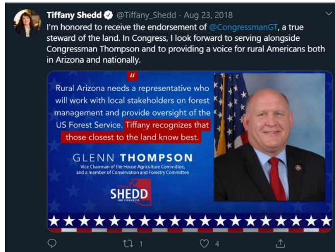
[Tiffany Shedd, Twitter, 4/3/20 ]