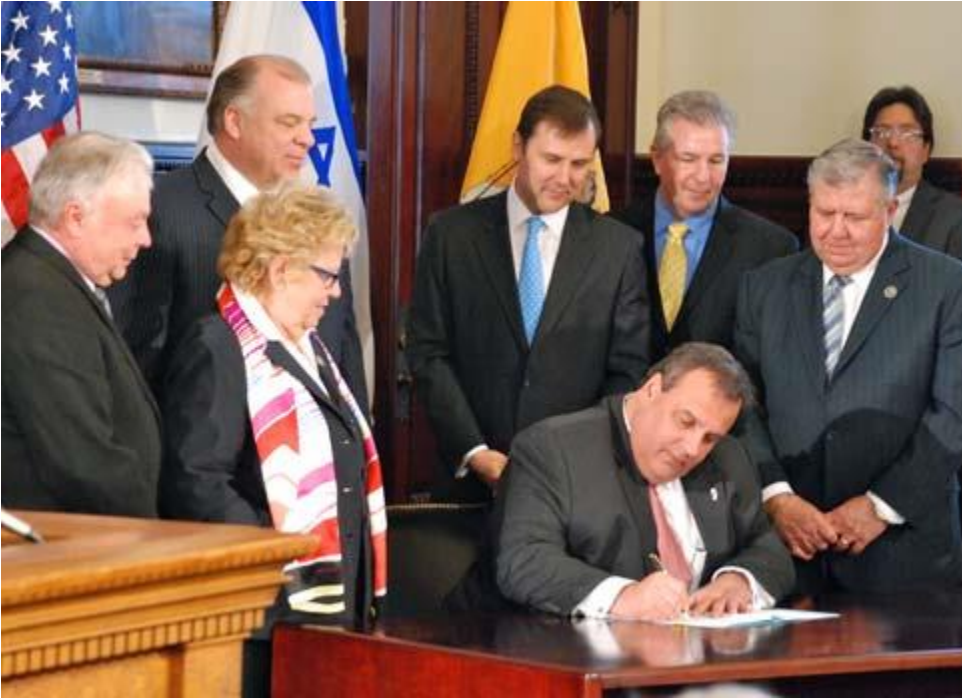
[New Jersey Senate, 4/15/13 ]