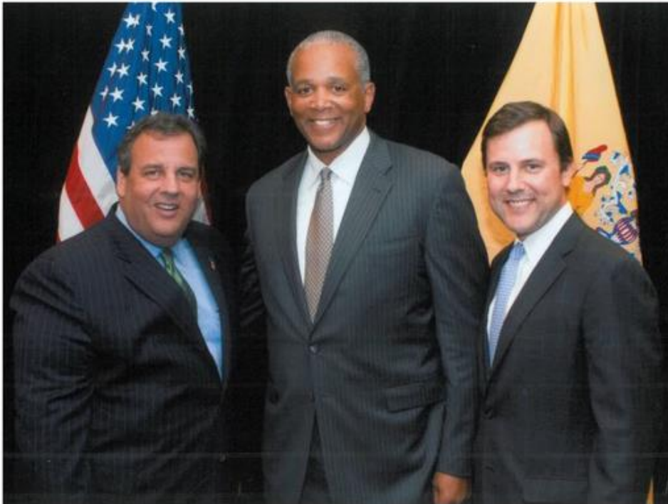
[New York Shipping Association, accessed 9/6/19 ]