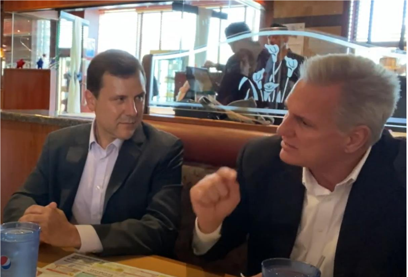
[YouTube, SaveJerseyBlog, 7/14/21 ]