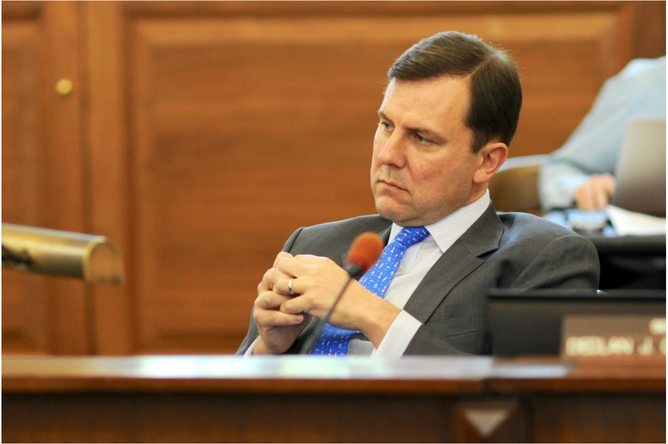
[NJ Dems, accessed 11/3/21 ]