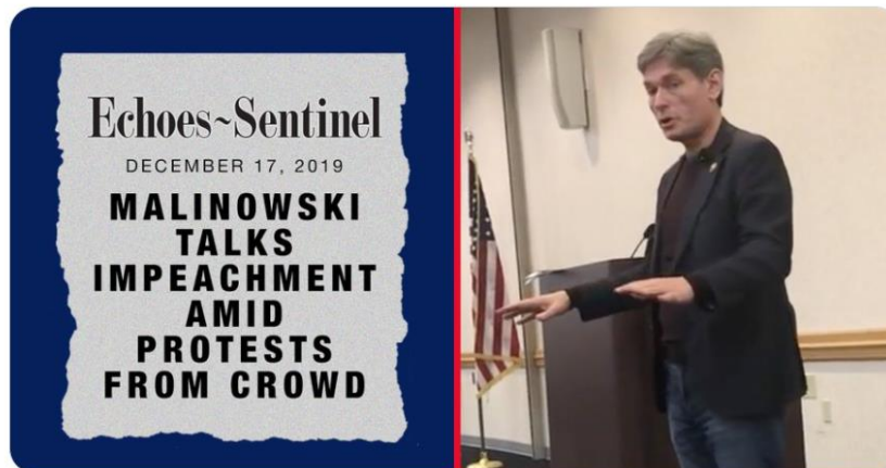
8:54 AM · Dec 17, 2019 · Twitter Web App

New Jersey deserves progress, not partisan protest.