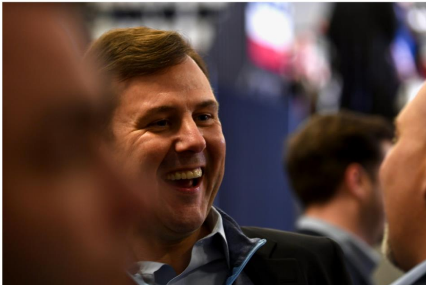
Senate Minority Leader Tom Kean, Jr., (R-Westfield).