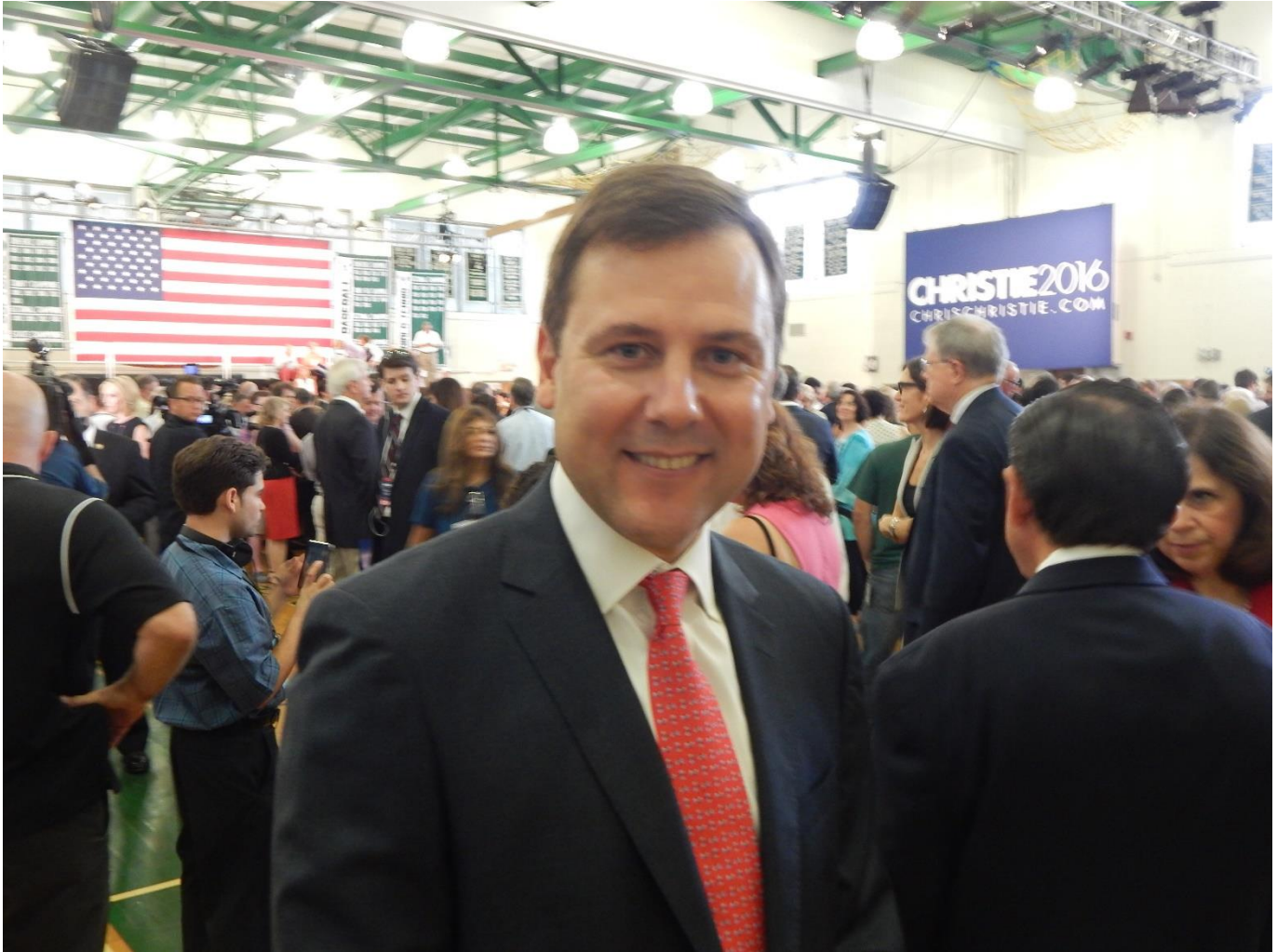
[Observer, 6/30/15 ]