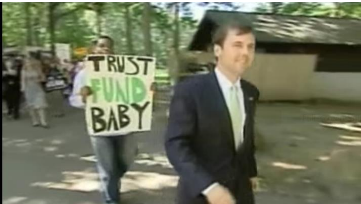
[Insider NJ, 10/20/19 ]