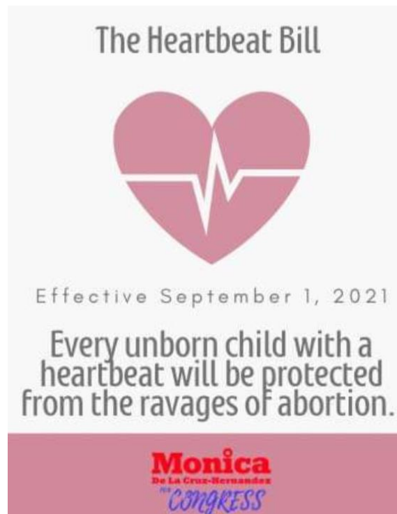
[Monica De La Cruz, Twitter, 9/2/21 ]