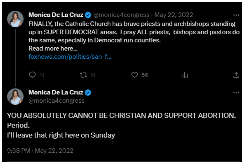
[Monica De La Cruz, Twitter, 5/22/22 ]