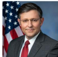
Rep. Mike Johnson Speaker of the House