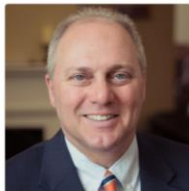
Rep. Steve Scalise Majority Leader