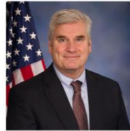
Rep. Tom Emmer Majority Whip

[Monique DeSpain for Congress, Endorsements, accessed 8/15/24 ]