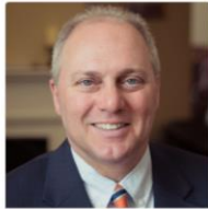
Rep. Steve Scalise Majority Leader