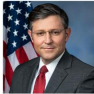
Rep. Mike Johnson Speaker of the House